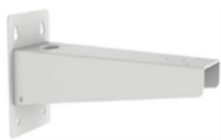
DS-1701ZJ/HWB Wall Mount Bracket