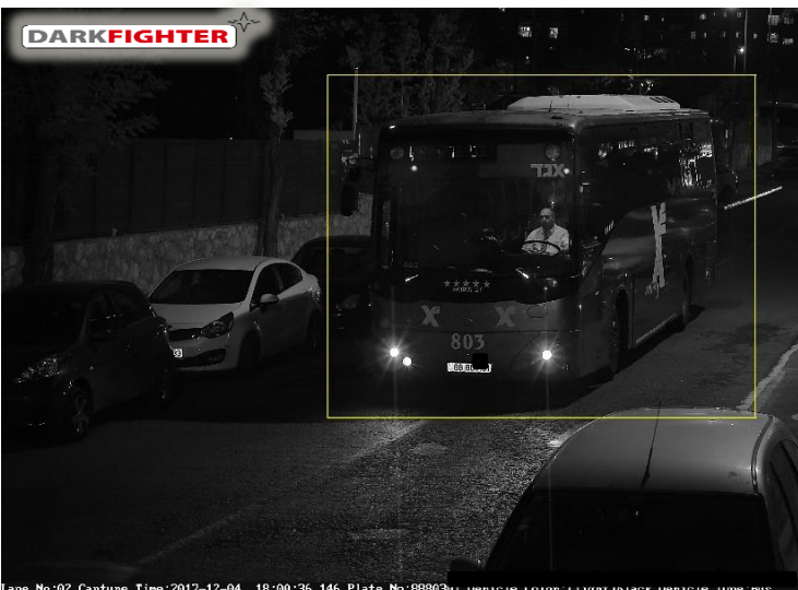
Lane No:02 Capture Time:2017-12-04 18:00:36.146 Plate No:888603 vehicle color:lightblack vehicle type:bus