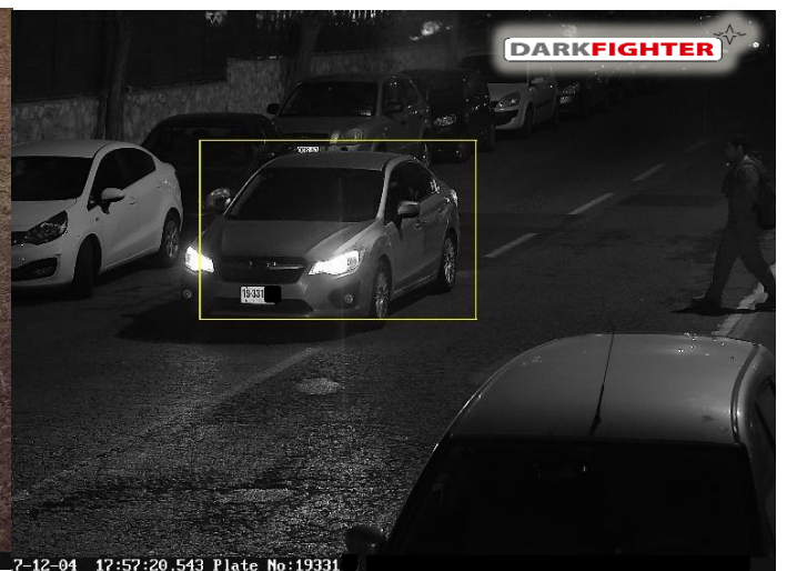
7-12-04 17:57:20.543 Plate No:19331