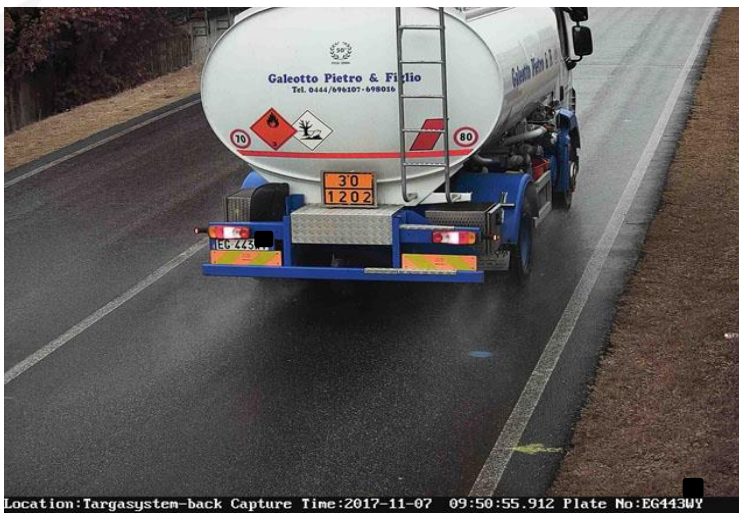
Location:Targasystem-back Capture Time:2017-11-07 09:50:55.912 Plate No:EG443MY