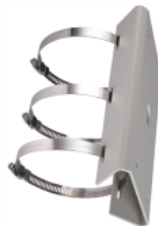
DS-1275ZJ/HWB Vertical Pole Mount