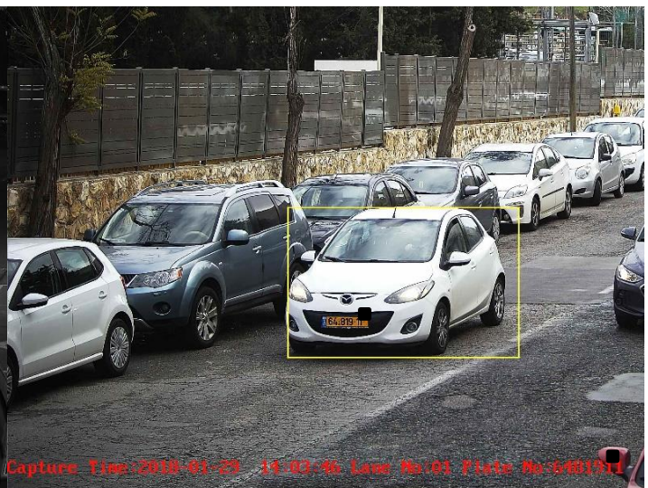
Capture Time:2018-01-29 14:03:46 Lane No:01 Plate No:648191