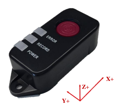
Figure 3.1 Installation Position