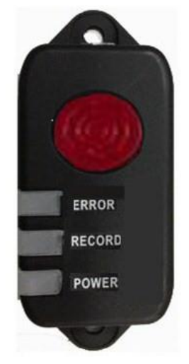
Figure 1. 1 Physical Interface

The DS-1530HMI Mobile Alarm Terminal is composed of panic button, ERROR, RECORD, and POWER indicators shown as the figure below.