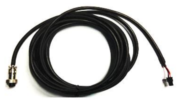
Figure 1. 2 Adapter Cable

Along with the mobile alarm terminal, an eight-meter long adapter cable is provided with one five-pin female aviation plug for connecting to DVR and the other H2 \times 2 interface for connecting to mobile alarm terminal. The adapter cable is shown as below.