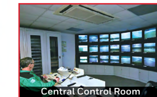
Central Control Room