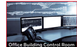
Office Building Control Room