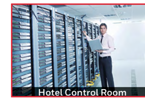
Hotel Control Room

X-618 MEGA Public Address System is an Ethernet based distributed system which provides several benefits with reduced cabling cost by minimizing the distance between amplifier and speaker in multiple locations, redesigning or upgrade of the system as your needs change or grow with minimal additional cost based on the flexible system architecture, broadcasting from any call station to any speaker zone in the network. No matter if you are building a new school or renovating an office building, X-618 MEGA would be the most suitable solution for you. X-618 MEGA also offers a central management software X-SMART, simplifying the control of a decentralized system and providing useful system information to make your management simple.