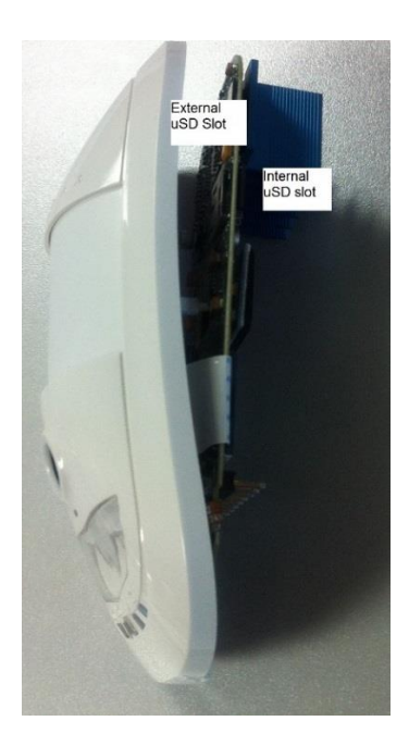
Figure 2 HD77 Camera External vs Internal slot