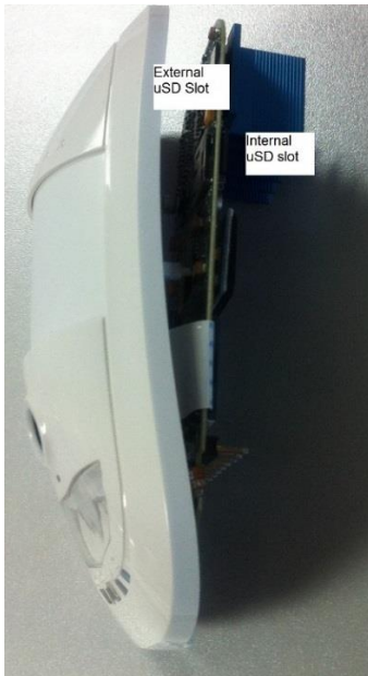
Figure 2 HD77 Camera External vs Internal slot