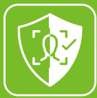
New Height of Anti-Spoofing