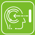
Proactive Facial Recognition