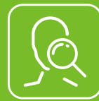
Touchless for Better Hygiene