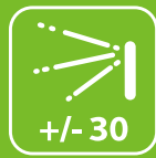
Wide Pose Angle Acceptance